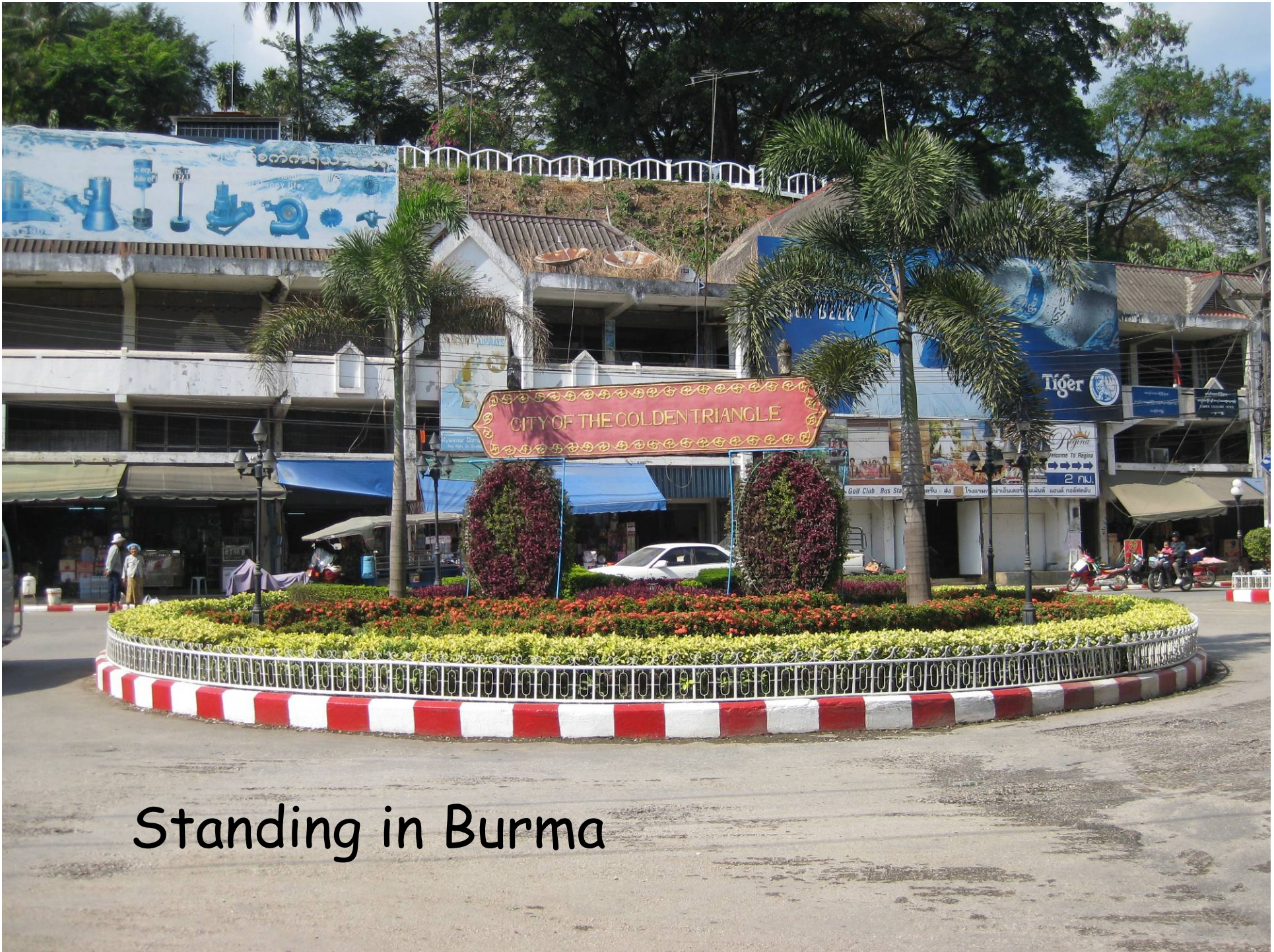
Standing in Burma