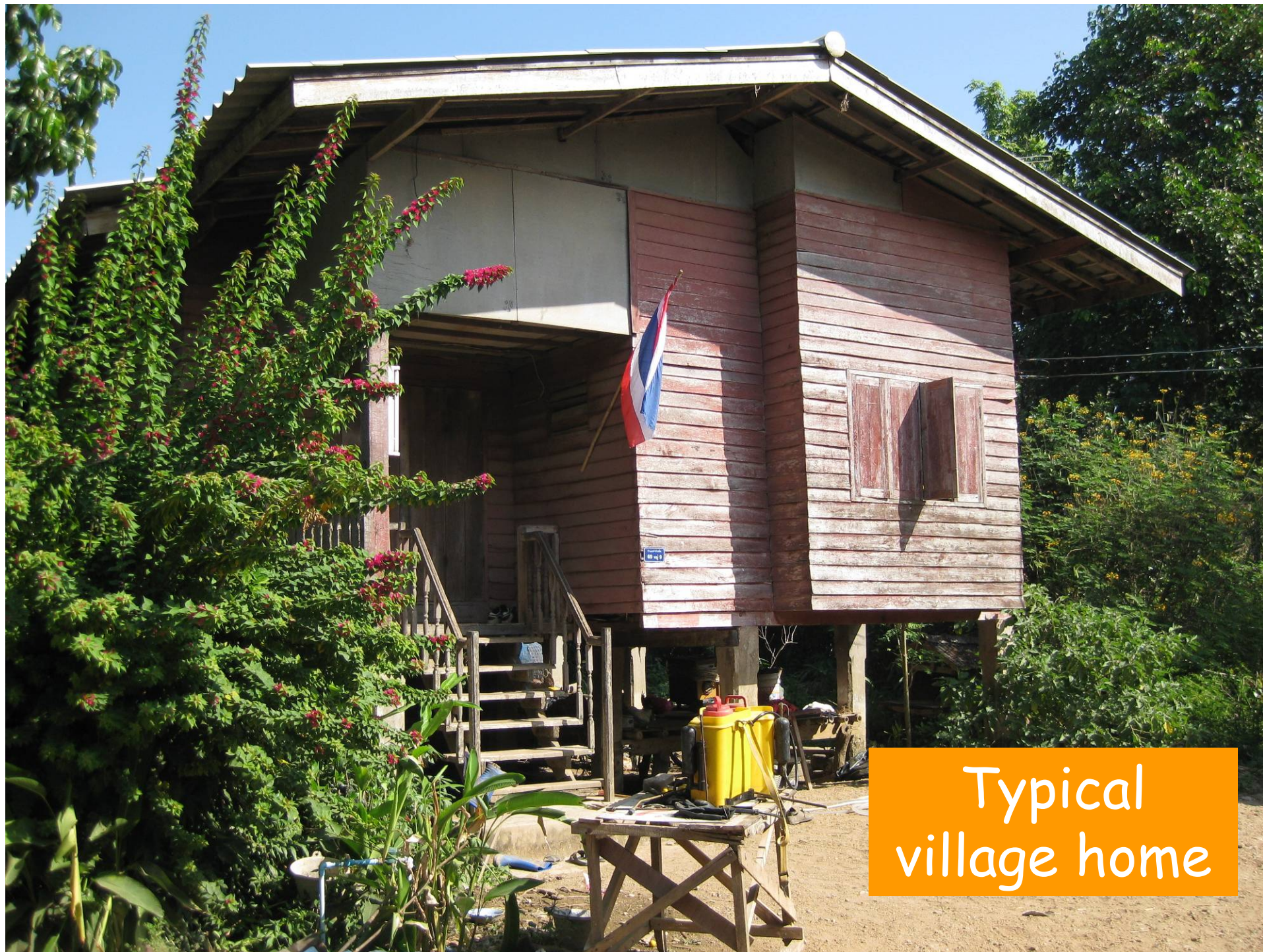
Typical village home