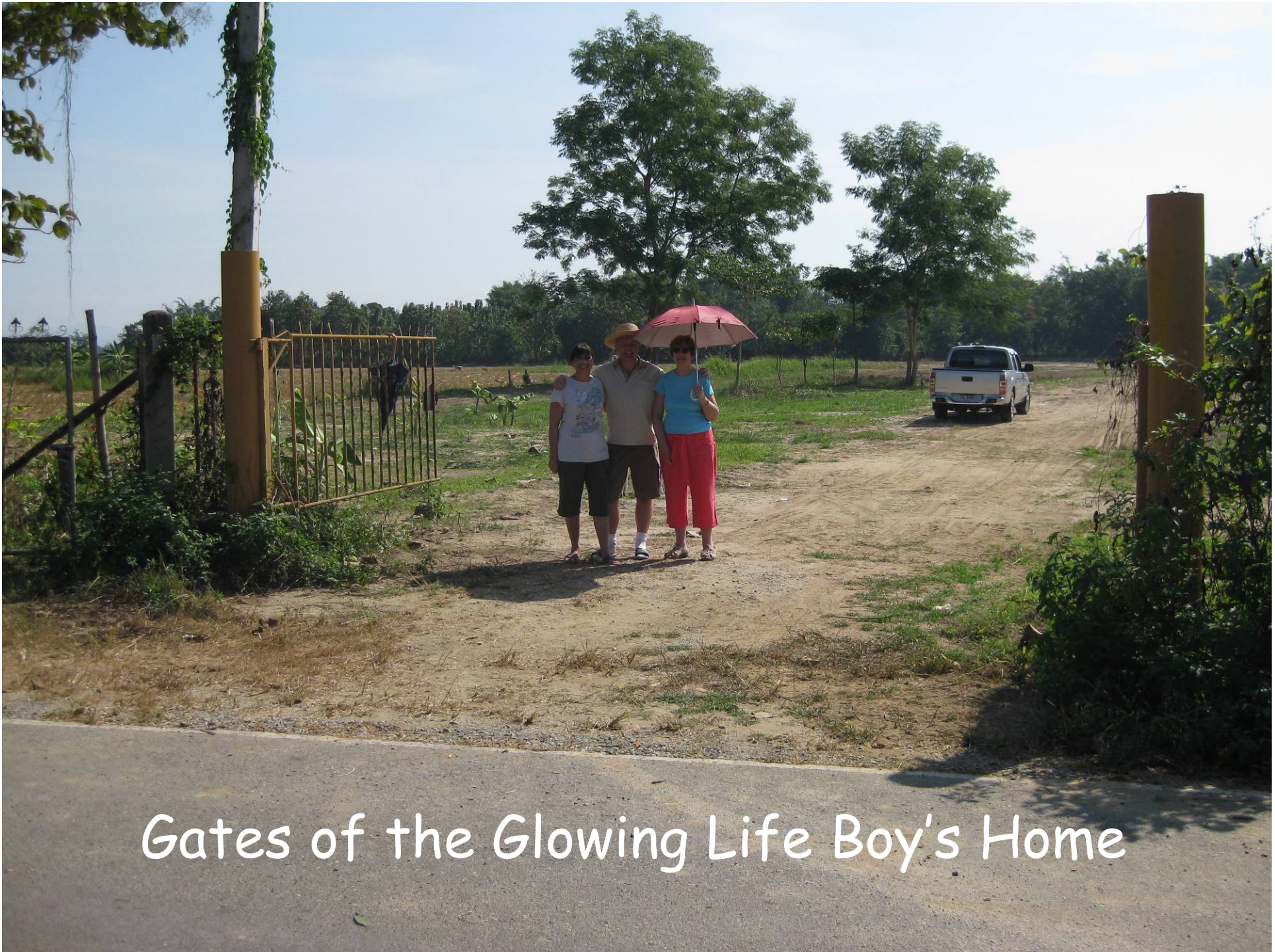
Gates of the Glowing Life Boy's Home