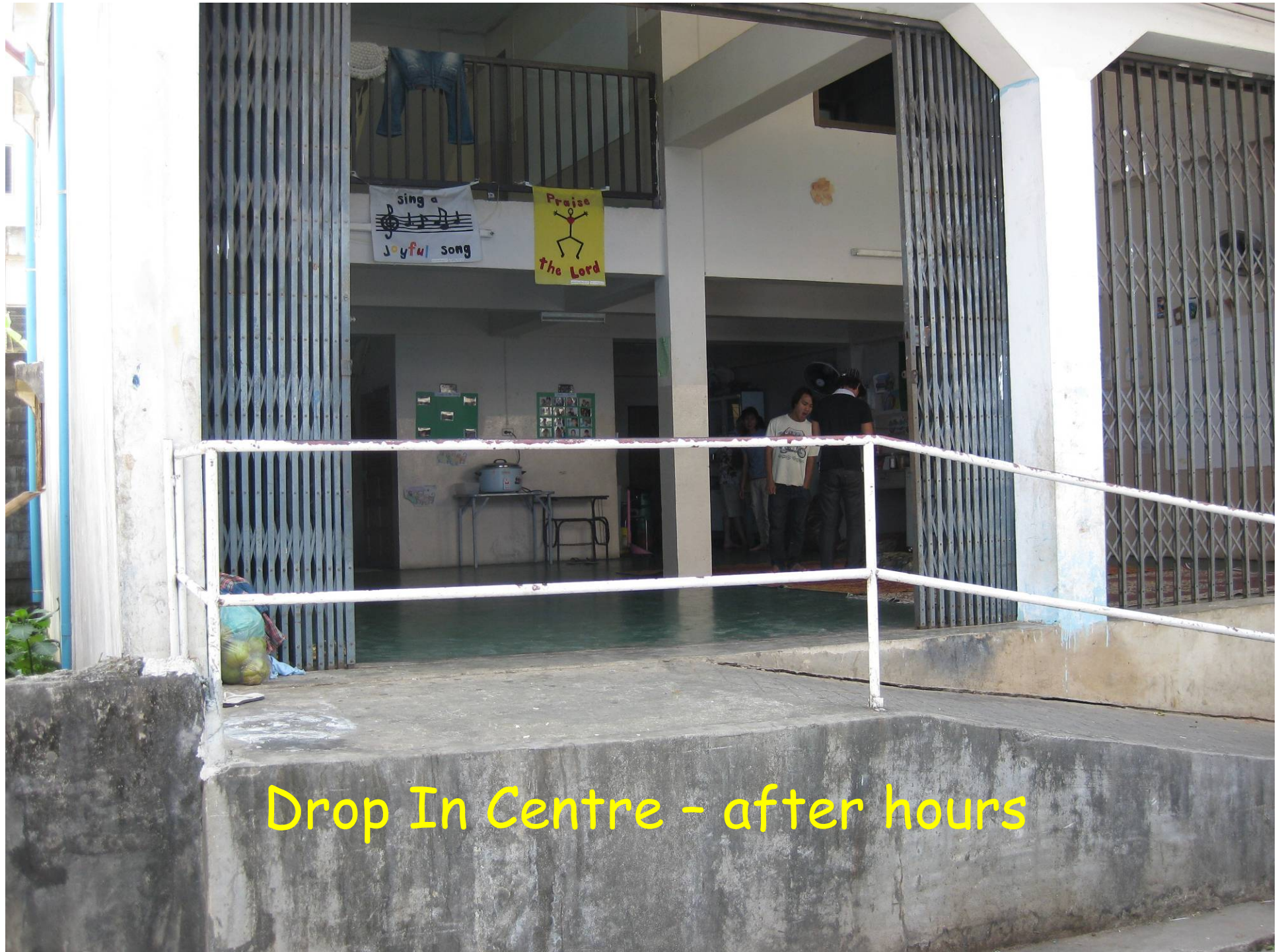
Drop In Centre - after hours