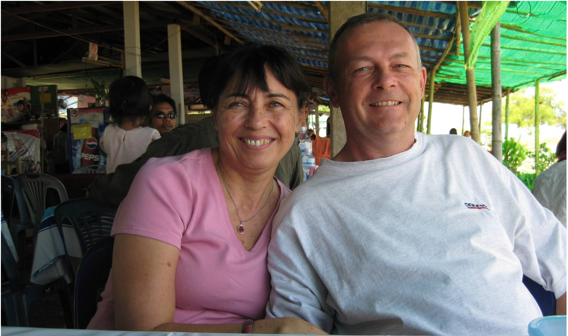
Coffee at Mae Khong River Border with Laos