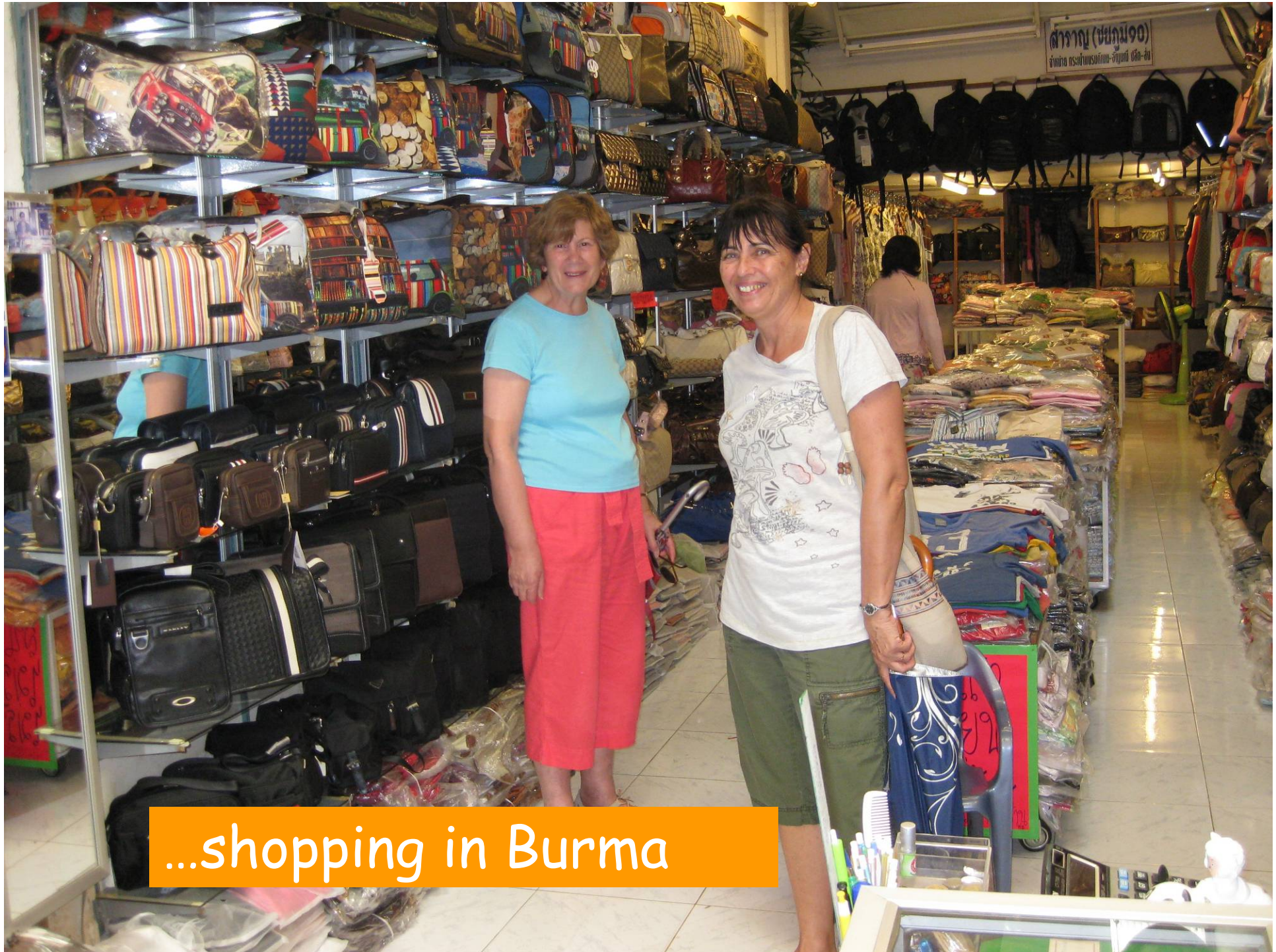
...shopping in Burma