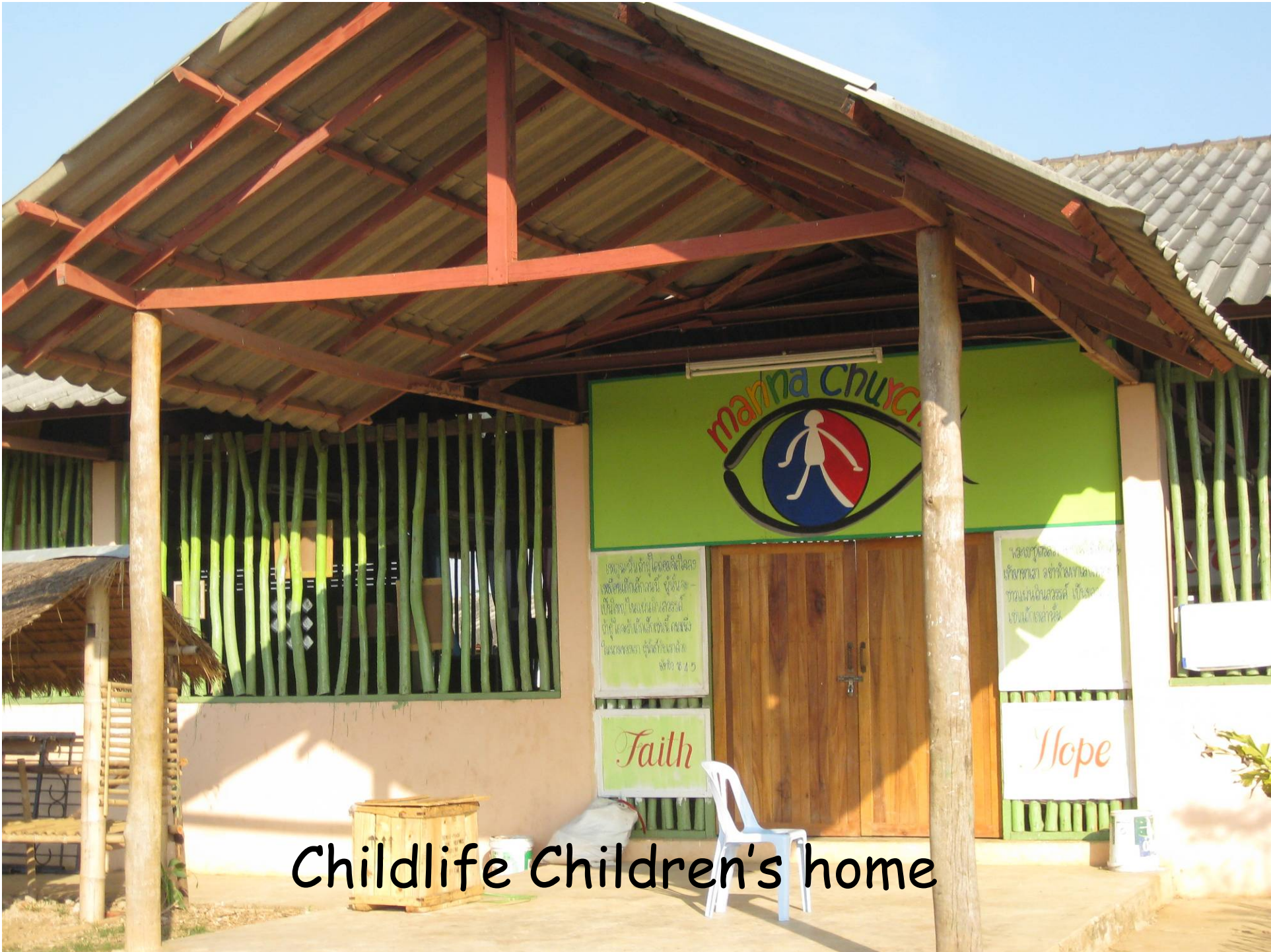
Childlife Children's home