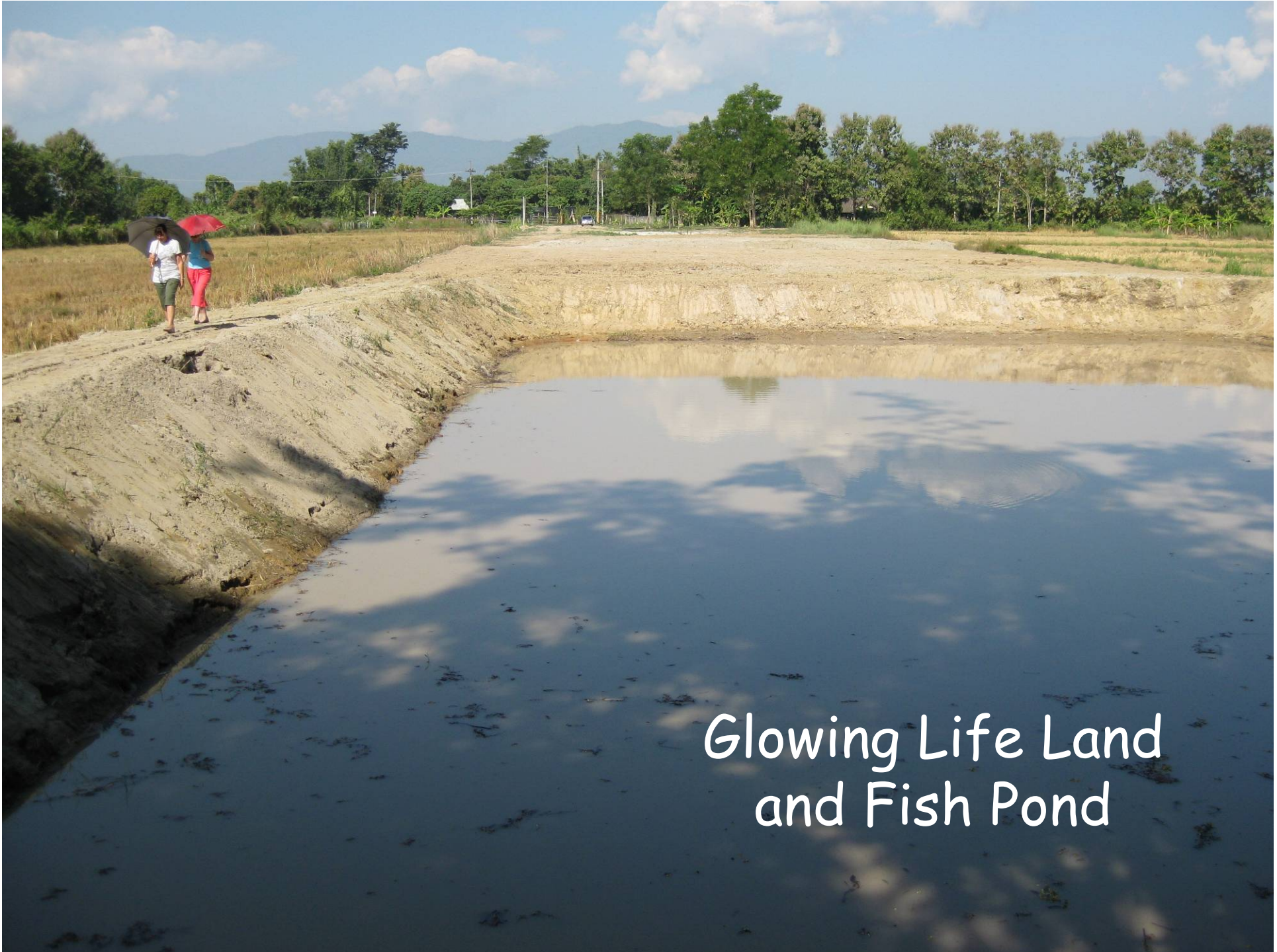
Glowing Life Land and Fish Pond