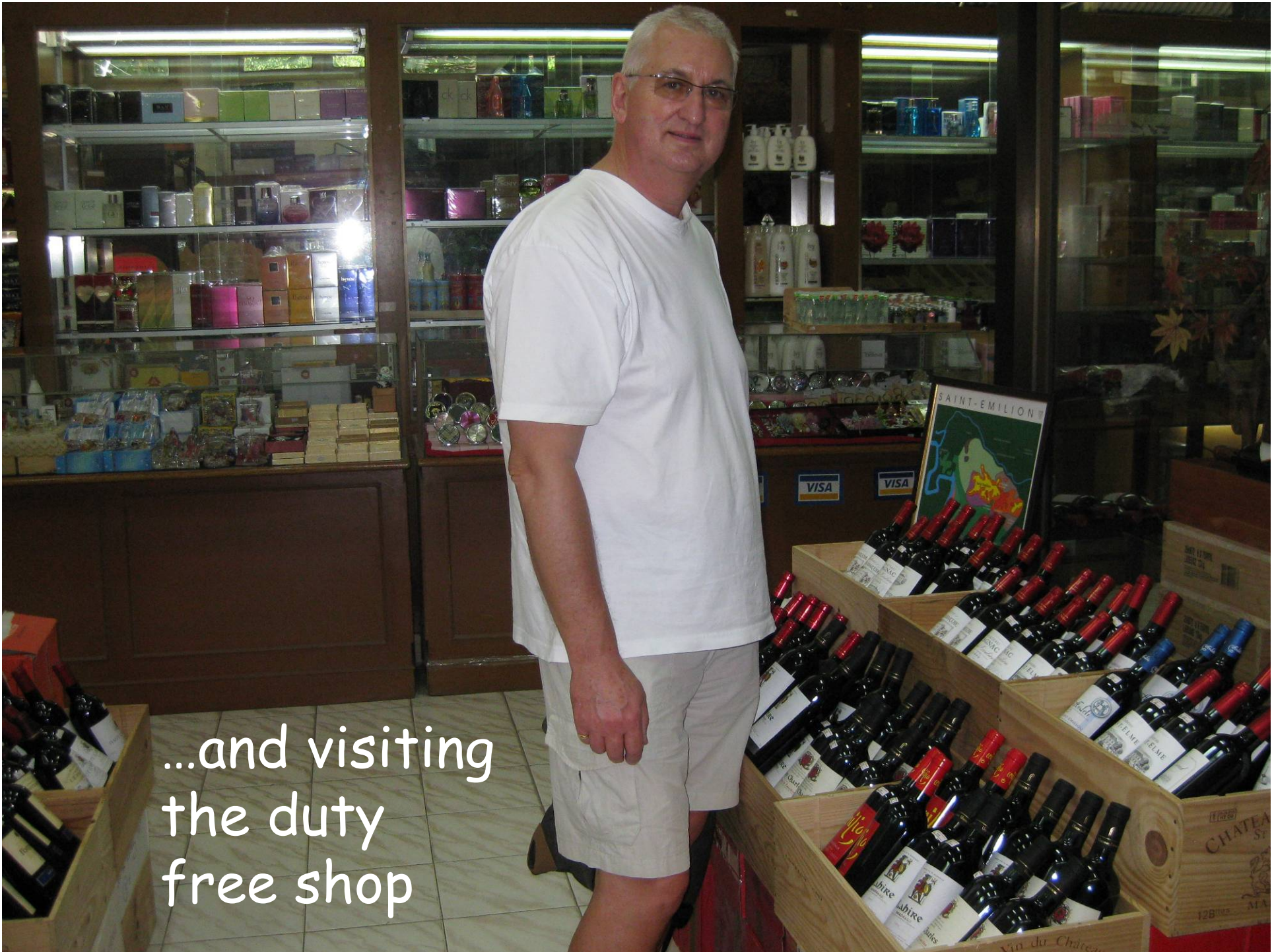
...and visiting the duty free shop