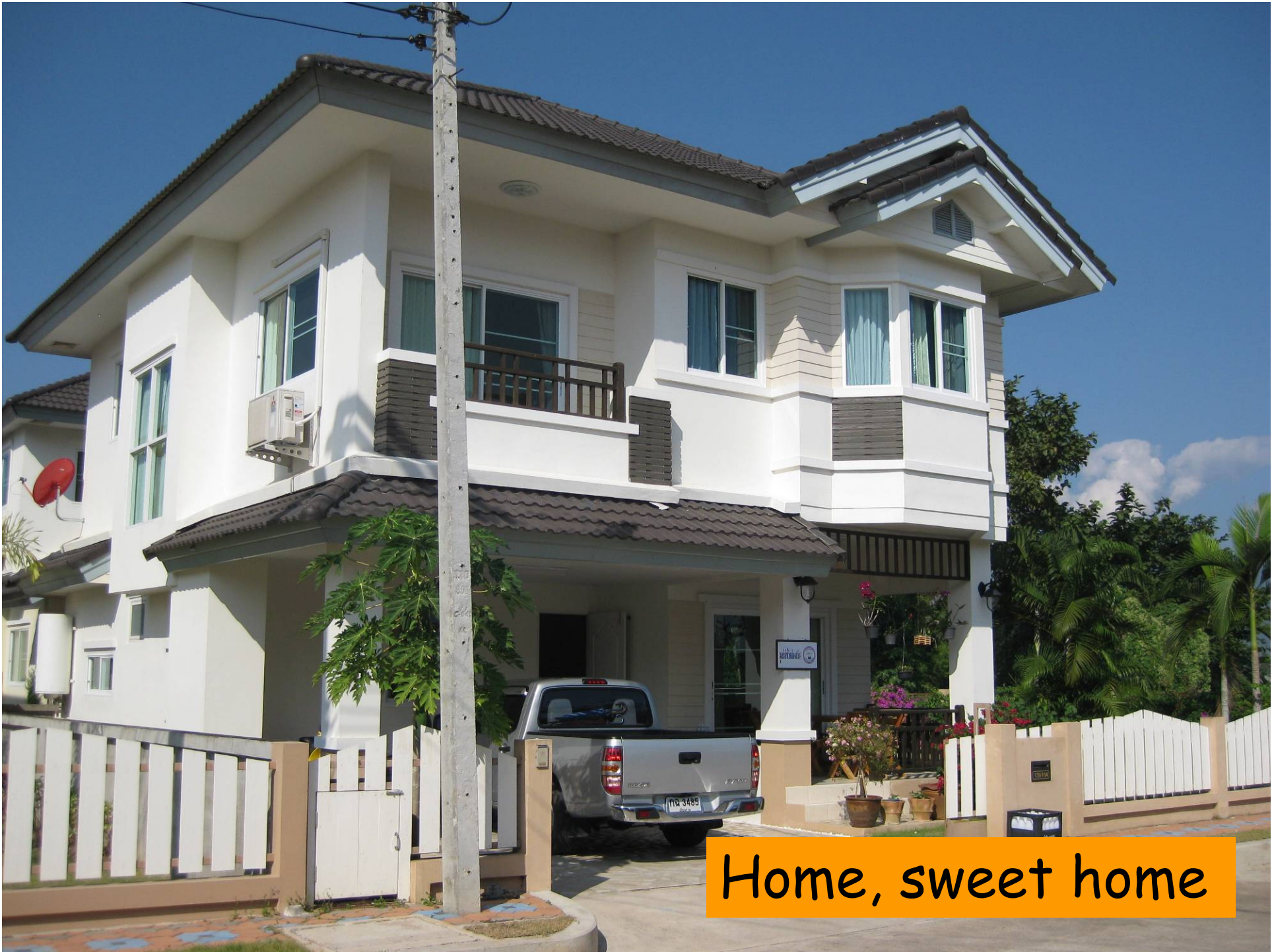
Home, sweet home