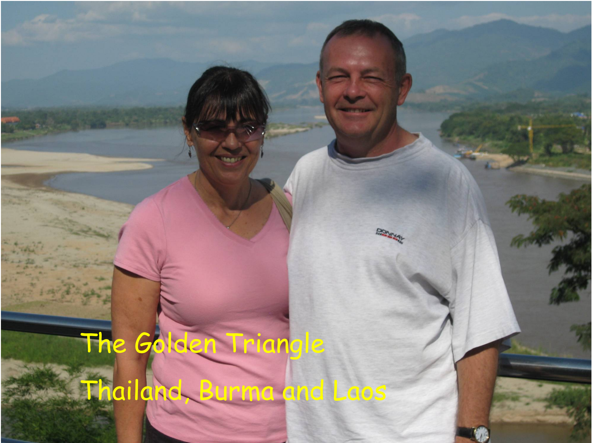
The Golden Triangle Thailand, Burma and Laos