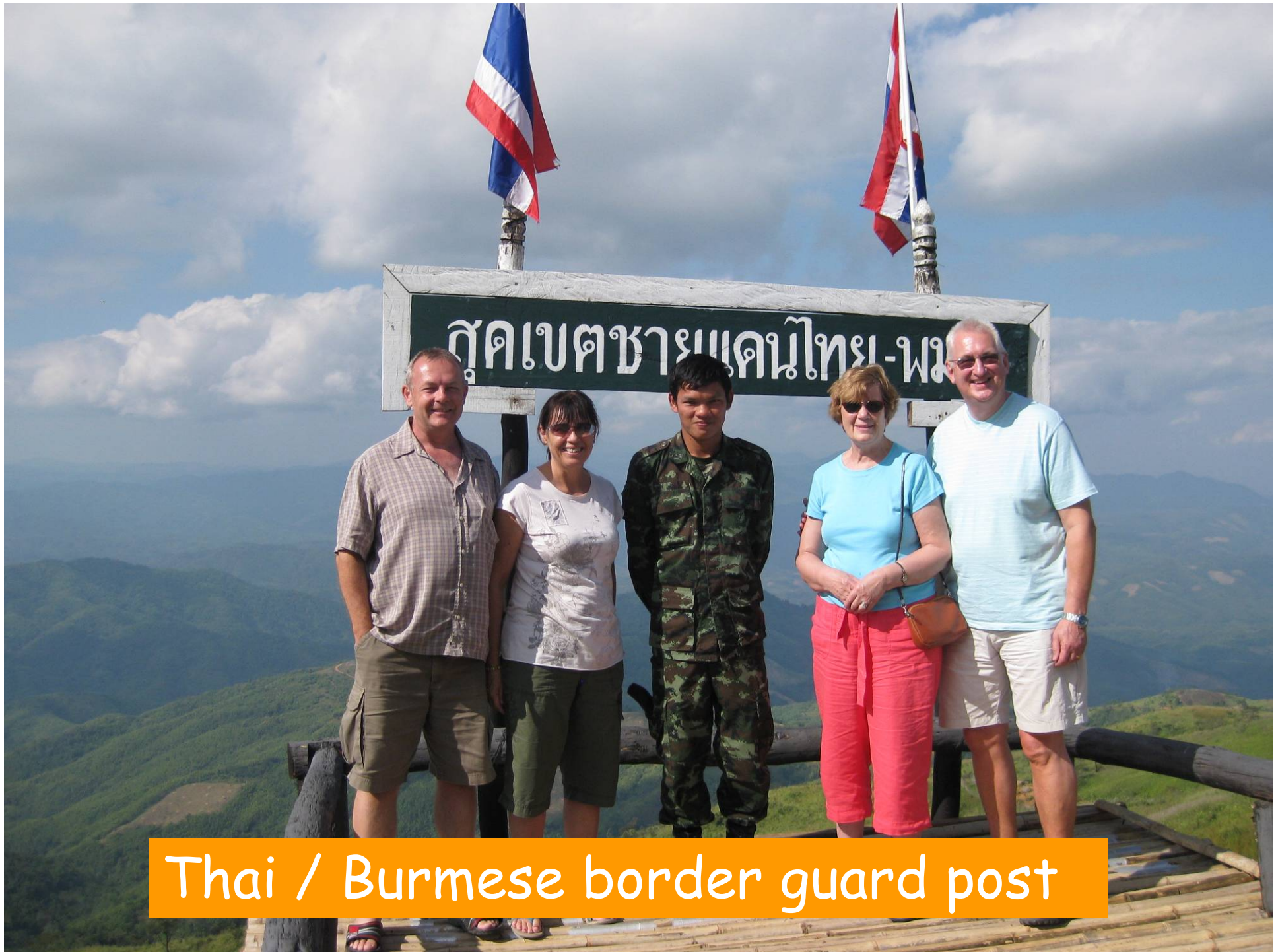
Thai / Burmese border guard post