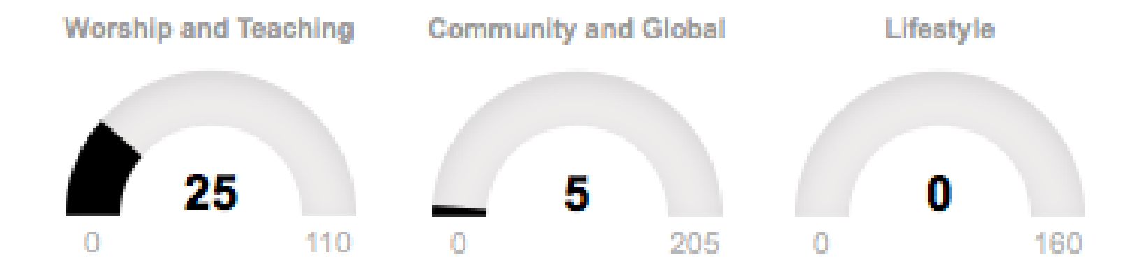
e.g. Our church prays for environmental issues Wherever possible, Fairtrade and/or ethically sourced goods are used at church services and events Our church funds are ethically invested