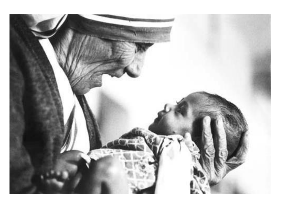
Love is Possible...